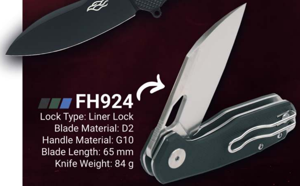
FH924 Lock Type: Liner Lock Blade Material: D2 Handle Material: G10 Blade Length: 65 mm Knife Weight: 84 g