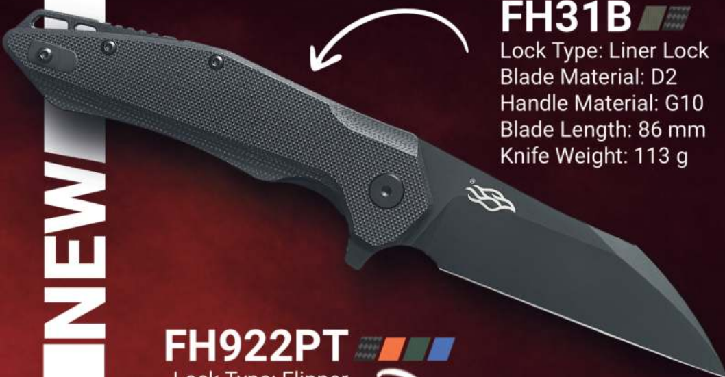
FH31B Lock Type: Liner Lock Blade Material: D2 Handle Material: G10 Blade Length: 86 mm Knife Weight: 113 g