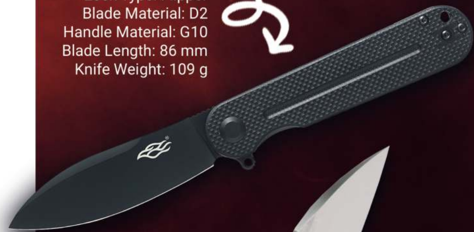
FH922PT Lock Type: Flipper Blade Material: D2 Handle Material: G10 Blade Length: 86 mm Knife Weight: 109 g