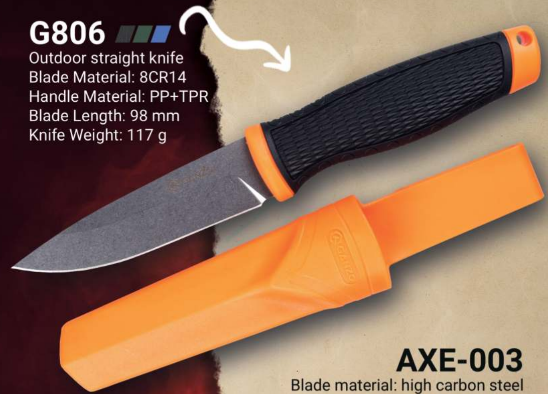
G806 Outdoor straight knife Blade Material: 8CR14 Handle Material: PP+TPR Blade Length: 98 mm Knife Weight: 117 g