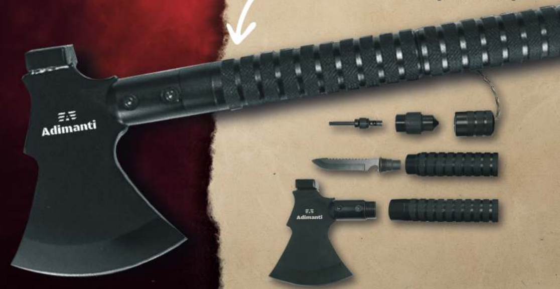
AXE-003 Blade material: high carbon steel Handle material: aviation aluminum Full length: 420MM Blade length: 117mm Net weight: 0.88 kg